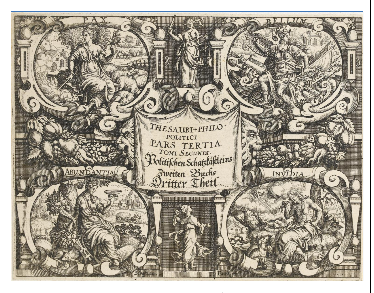
Fig. 1: Sebastian Furck, Frontispiece, in: Daniel Meisner / Eberhard Kieser, Thesaurus Philo-Politicus . Das ist: Politisches Schatzkästlein ... (Frankfurt on Main, 1629), II,3 Stuttgart, State Gallery, Department of Prints, Drawings and Photographs Inv.No. B 323,2,23r,107

Stuttgart Department of Prints, Drawings and Photographs owns a rare hitherto unrecorded first edition of this famous and influential series. [4]